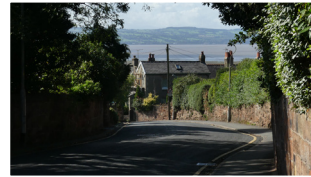
The Dee Estuary from Rocky Lane